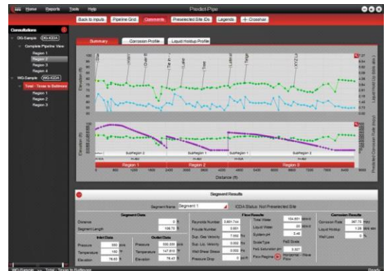
Predict-Pipe: Pipeline Corrosion Results Summary for Wet Gas Internal Corrosion Direct Assessment