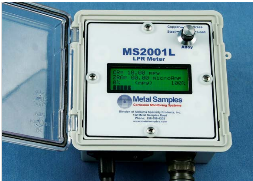
Figure 3 - Typical Measurement Display

After one minute the display should show the corrosion rate on the first line of the LCD display. After 30 more seconds, the display should show the ZRA value on the second line of the display. The bottom line of the LCD display shows a bar graph of the corrosion rate. This is illustrated below in Figure 3.