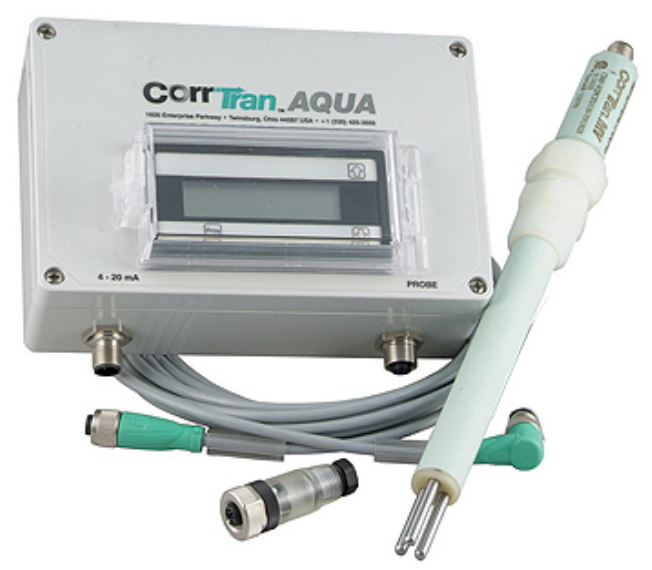
Probe shown in photo not included with transmitter

The CorrTran AQUA works with Metal Samples threeelectrode CorrTran style probes and electrodes. Probes are available in a variety of mounting types and materials to suit almost any type of installation.