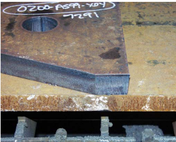
1.5 inch part cut at Bender