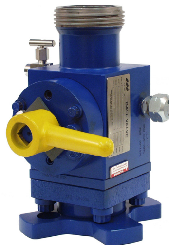
Figure 1. Service Valve

The valves have a bleed valve located on the non-process side of the ball. This bleed valve may be used to drain the retrieval tool, sample process, or be used as a path for back-pressuring. All valves are NACE MR0175 compliant for use in sour service, factory pressure tested for a working pressure of 6000 psi* W.O.G..