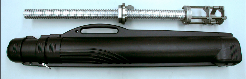
Easy Tool Retracting System & Case