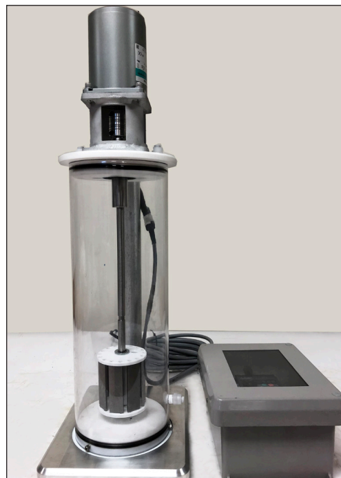
Atmospheric Pressure Rotating Cage to Evaluate Corrosion Inhibitors in the Oil and Gas Industry

Atmospheric Pressure Rotating Cage Assembly (Part # TF4500) - includes test chamber, controller, and 1 set of 8 coupons (Part # COZ733777104100)